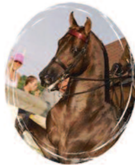
CKH SPIRITED GIFT Serenity Terry X Serenity Sweet Time